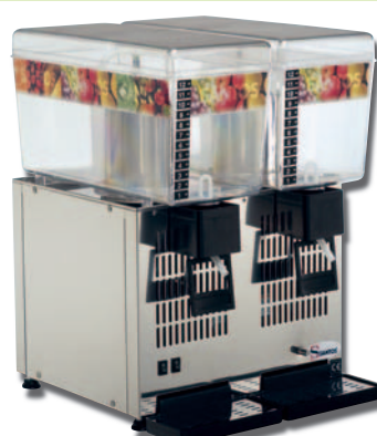
34 - 2 (twin bowl) 2 x 12 litre capacity