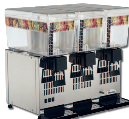
34 - 3 (triple bowl) 3 x 12 litre capacity