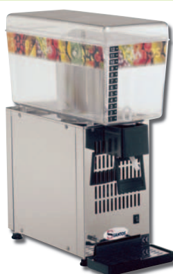
34 - 1 (single bowl) 12 litre capacity